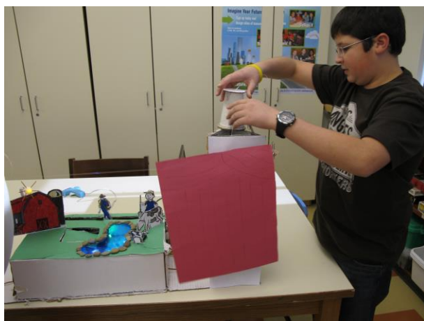
Fig. 1: A student works a robot which illustrates the Mechanical Sophistication tier of "Transformation Mechanism". This robot uses counterweights, shown in the student's hand, and a pulley system to rapidly open the red paper curtains when the robots' servo opens a trapdoor supporting the counterweights.

Communication and Artistry has two levels. The most basic is “Practical Construction”, and the more advanced is