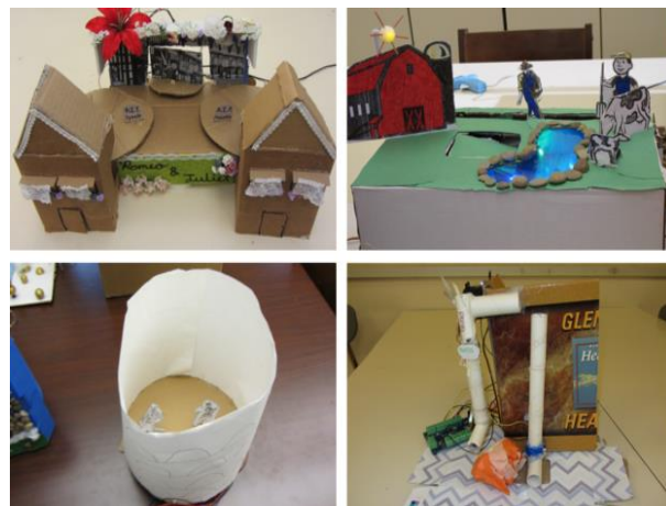
Fig. 2: Four robots illustrating different degrees of Mechanical Sophistication, and Communication and Artistry: (clockwise from top left) audience consideration with direct motion; audience consideration with transformation mechanism; practical construction with transformation mechanism; practical construction with direct motion.

Indicating an even higher tier of Communication and Artistry, some robots incorporate novel ideas and artistic